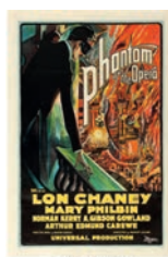
THE PHANTOM OF THE OPERA 1925