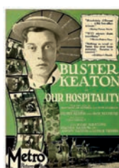
OUR HOSPITALITY 1923