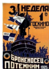
BATTLESHIP POTEMKIN 1925