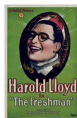
THE FRESHMAN 1925