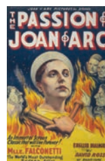
THE PASSION OF JOAN OF ARC 1928