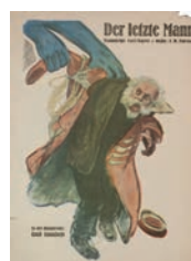
THE LAST LAUGH 1924